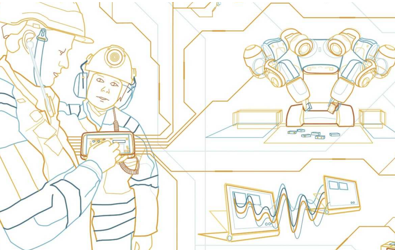
ABB is also at the forefront of the ever-tighter integration of sophisticated information technology and hard-wired infrastructure, the so-called “smart grid”. Smart grids offer further potential for efficient use of electrical energy by interlocking the requirements of energy producers and consumers, while coping with fluctuating renewable energy sources.

As mentioned above, we are entering a new industrial age where the internet meets production, and this has the potential to profoundly transform global industry in ways that support efficiency improvements.